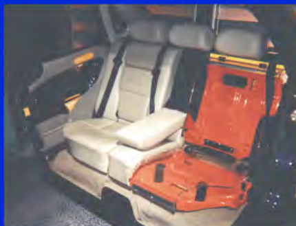
HSLA Seat Reinforcing.